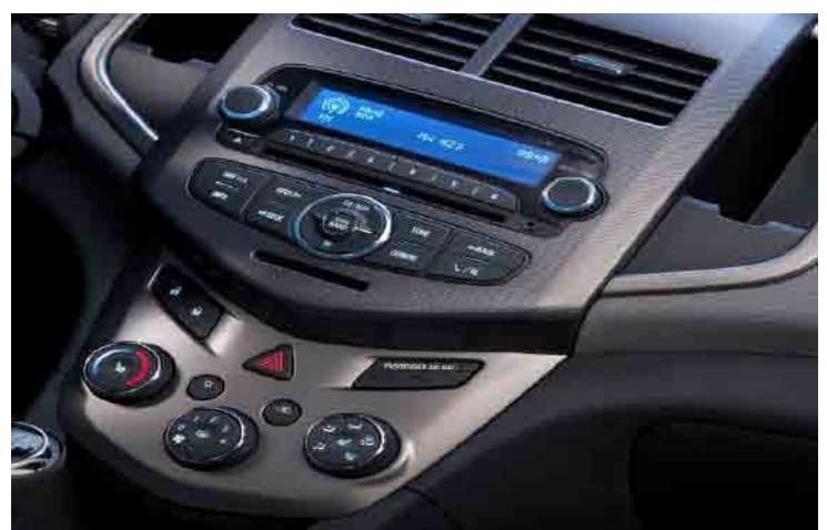
1. With PRT unclip radio bezel and remove.