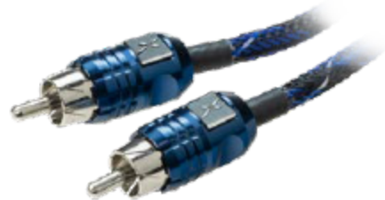
Delta Twisted Audio Cable

To learn more about these exciting new EFX products, all of which are available now, please visit the Scosche Virtual Booth at SEMA360.